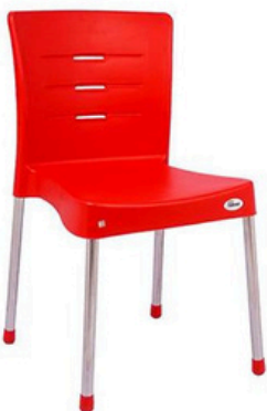
Stellina - Red