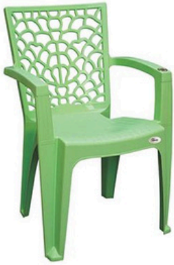
Scorpio - Green