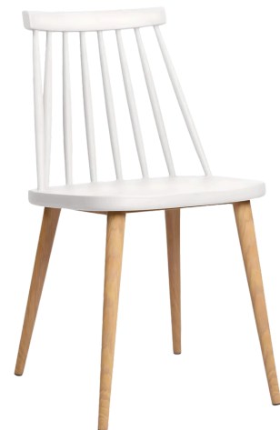
Imported Chair - White