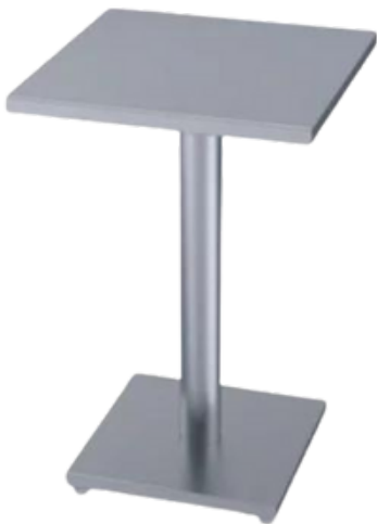
SS Square Standing Dining Table