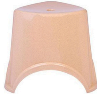
Symphony - Beige