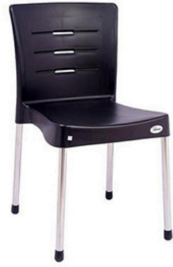
Stellina - Black