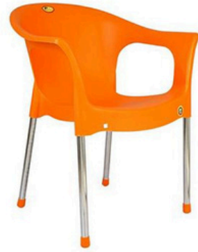
Stella - Orange