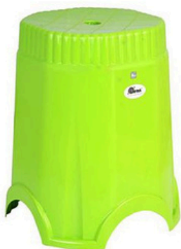
Spenser - Green