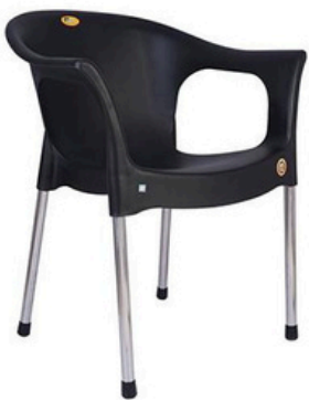
Stella - Black