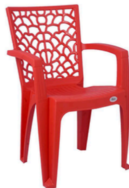
Scorpio - Red