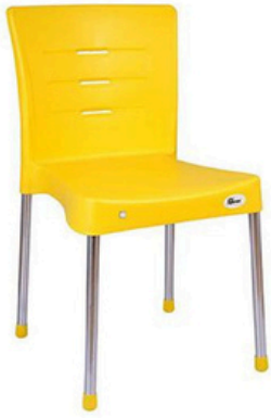
Stellina - Yellow