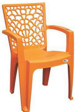
Scorpio - Orange