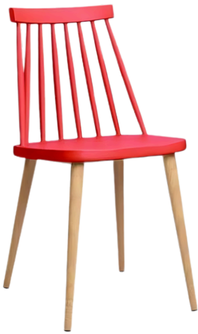
Imported Chair - Red