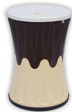
Swiggy - Brown