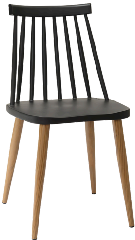
Imported Chair - Black