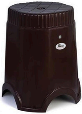
Spenser - Brown