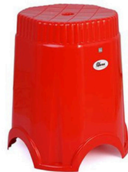
Spenser - Red