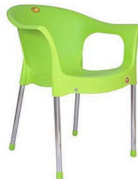
Stella - Green