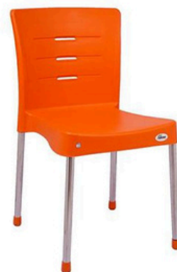
Stellina - Orange