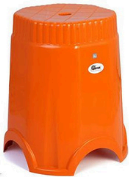
Spenser - Orange