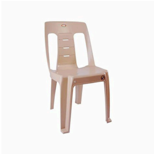
Seventeen - Beige