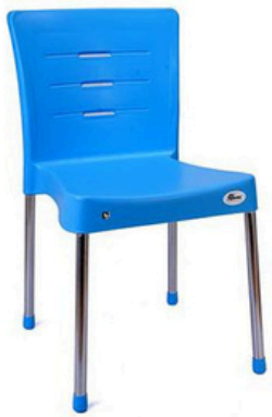
Stellina - Blue