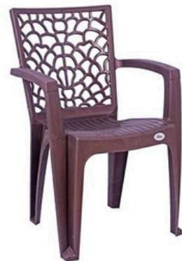
Scorpio - Brown