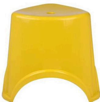
Symphony - Yellow