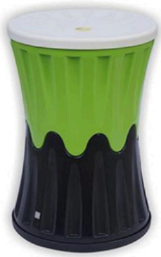
Swiggy - Green