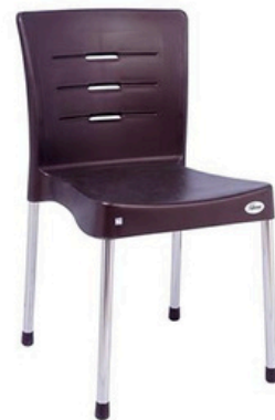
Stellina - Brown