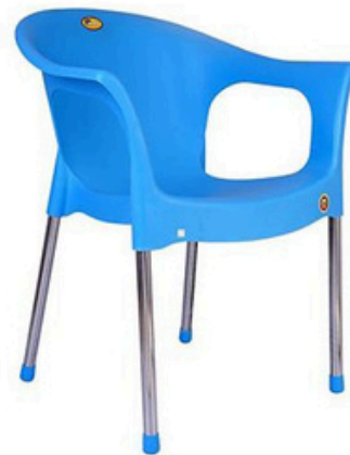
Stella - Blue