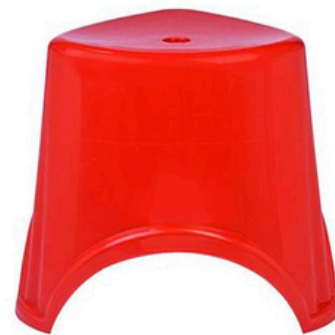
Symphony - Red