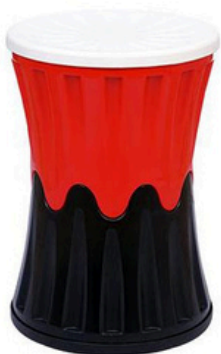
Swiggy - Red