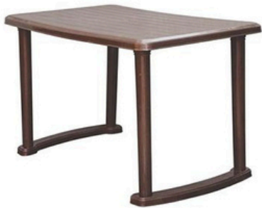
Dining Table - Brown