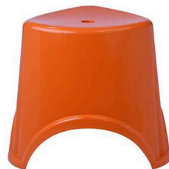
Symphony - Orange