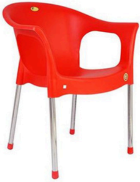
Stella - Red