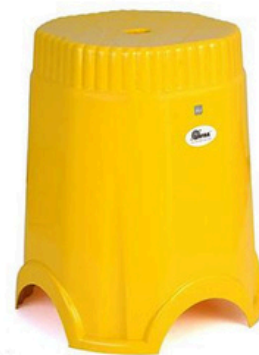
Spenser - Yellow