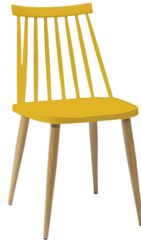
Imported Chair - Yellow