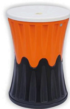
Swiggy - Orange