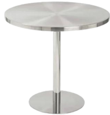
SS Round Standing Dining Table