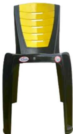
Dining Chair - Yellow