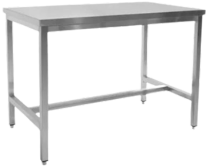
SS Dining Table