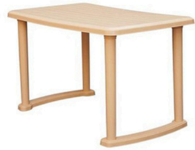
Dining Table - Beige