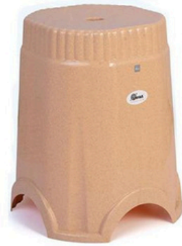
Spenser - Beige