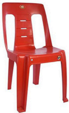
Seventeen - Red